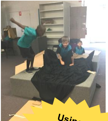
Using our imagination to create stories using boxes.