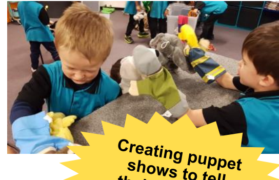
shows to tell their stories to an audience.