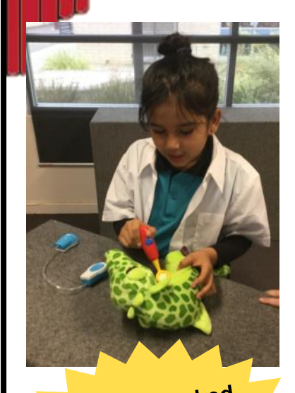
We have looked at different themes: space, jungle, vets and animals.